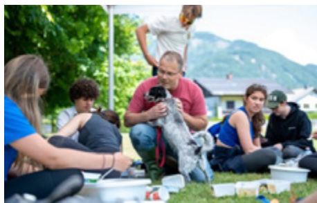
DP students collecting data at the stream