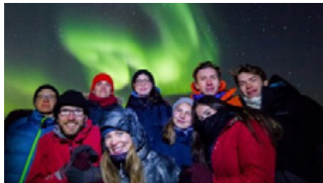
The 2019 Jupiter research team on their way to present their paper on the Jovian aurora at University College London